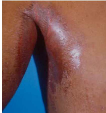
Figure 3: Representation of the flexural eczematous lesion.

and environmental factors. Genetic factors are likely to be important in determining the host response to HTLV-1 infection, perhaps determining the carrier state or disease manifestation among those susceptible, following HTLV-1 infection. In Japan, where HTLV-1 is most prevalent, IDH is hardly ever reported, while other skin eruptions associated with HTLV-1 infection are observed in a significant proportion of Japanese population 30 . This indicates that other factors such as environmental factors, in addition to genetics, are likely to play a causative role. Similarities have been noted particularly between IDH and HAM/TSP, both being inflammatory manifestations of HTLV-1 infection. The basis for this proposal is the finding of elevated proinflammatory cytokines in IDH cultured cells, as has been noted in HAM/TSP 15,31,32 . The immune dysregulation associated with HTLV-1 infection likely facilitates chronic superinfection with SA and/or BHS, which additionally leads to chronic antigenic stimulation and persistent inflammation in the skin.