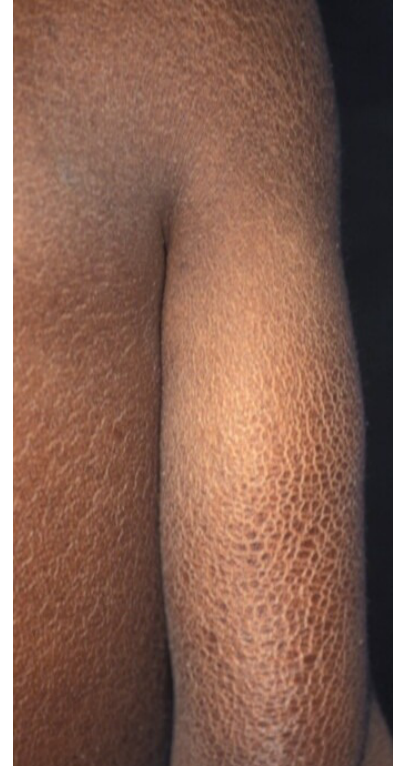
Figure 4: Representation of acquired ichthyosis on the trunk and limb.

Xerosis refers to dryness of the skin, while acquired ichthyosis presents as cutaneous xerosis together with polygonal thin flat squames of varied sizes principally in the extremities (Figure 4). About 67% of patients infected with HTLV-1,